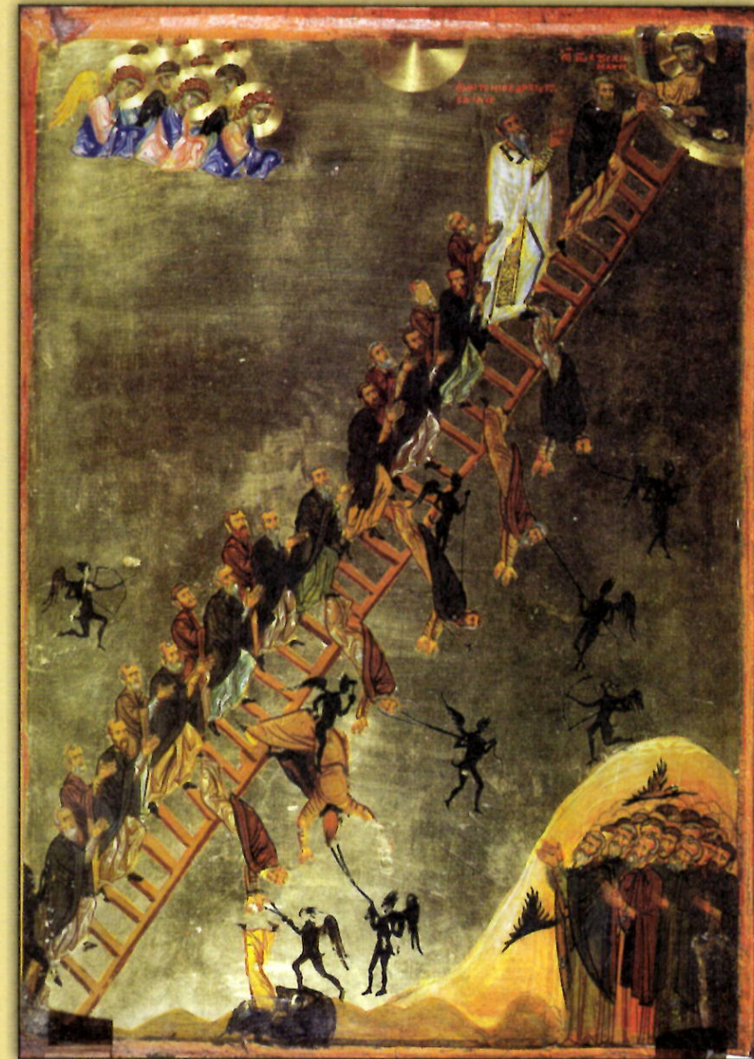
Icon of the Ladder of Divine Ascent