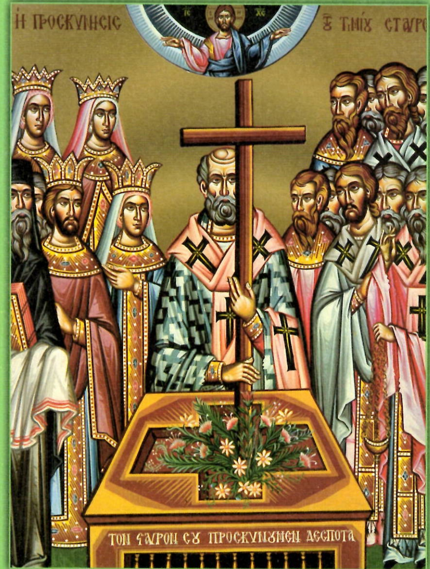
Icon of the Veneration of the Holy Cross