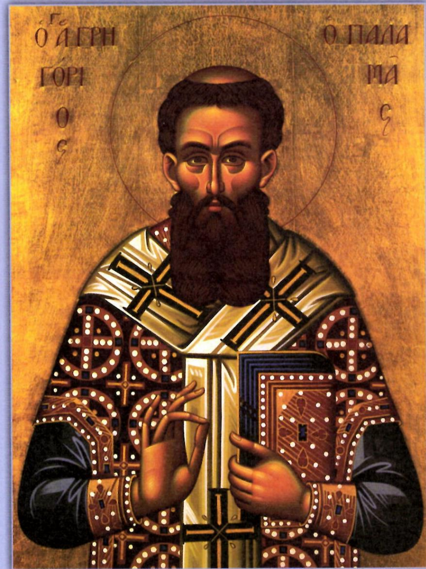
Icon of Saint Gregory Palamas