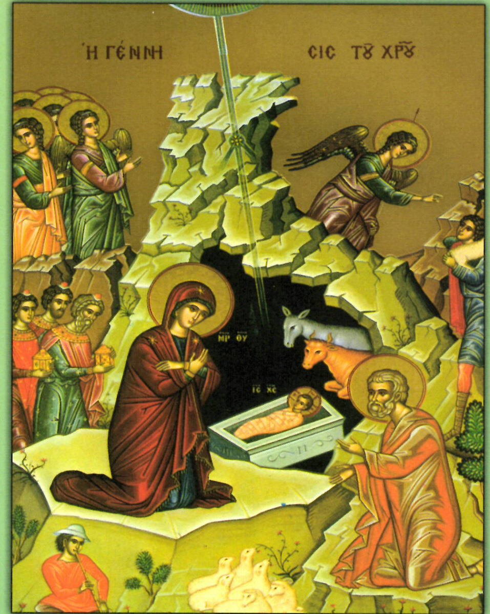
Icon of the Nativity of Our Lord