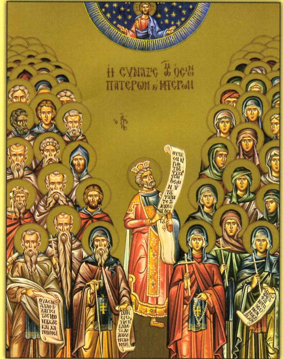
Icon of the Holy Ancestors