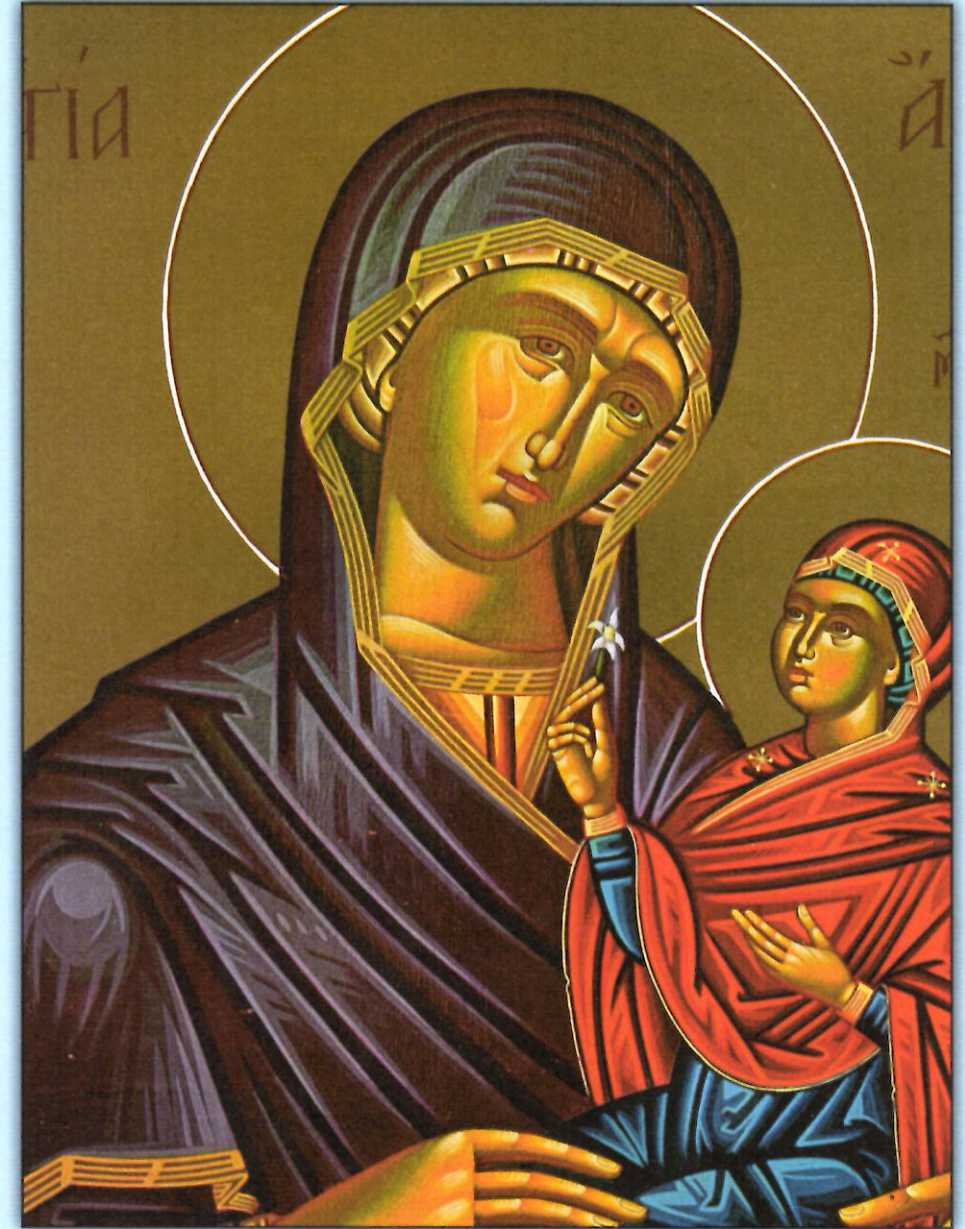
Icon of Saint Anna and the Mother of God