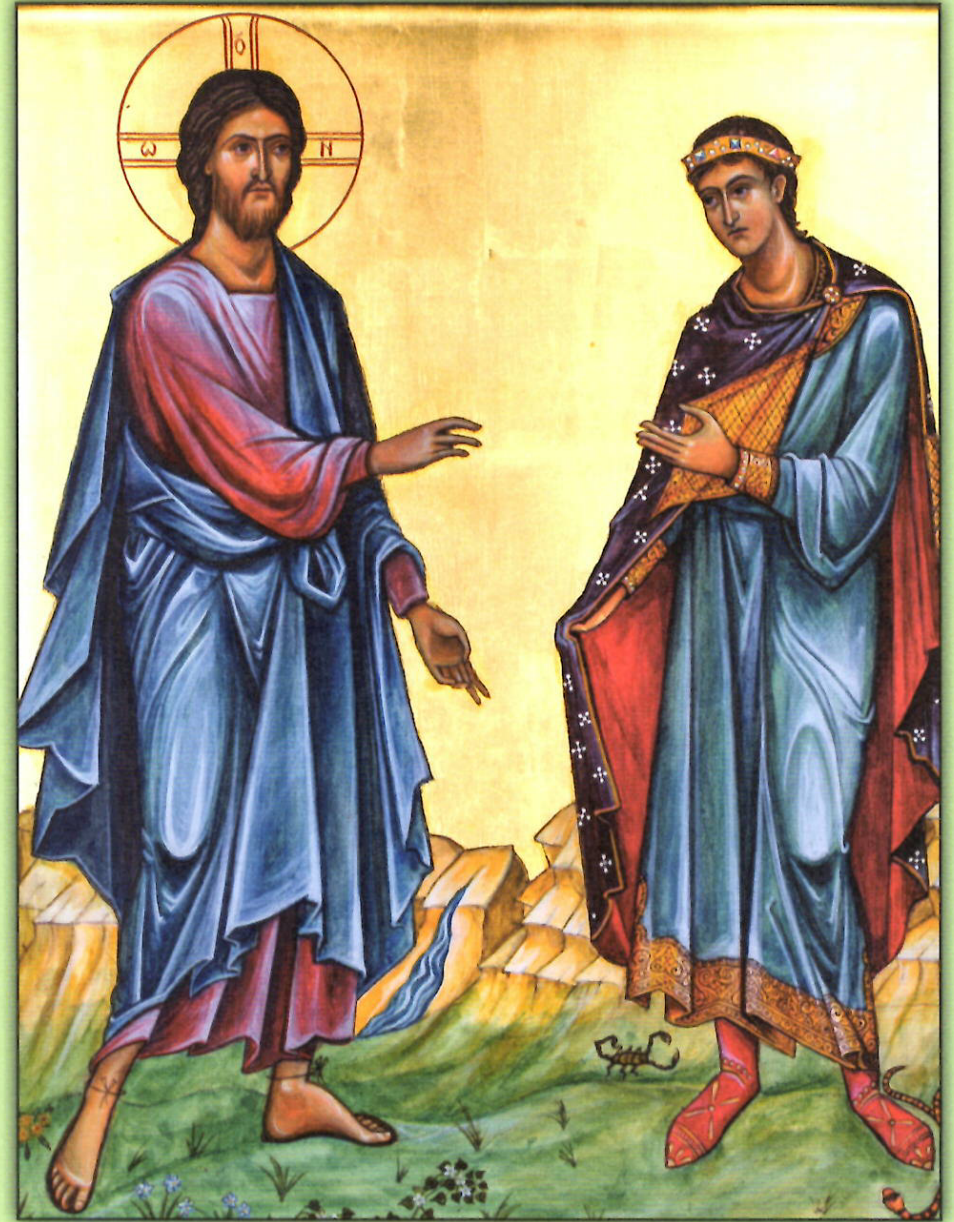
Icon of the Rich Young Ruler and Christ (Luke 18:18-27)