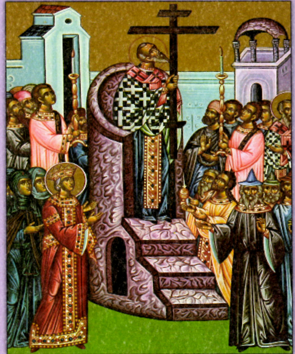
Icon of the Exaltation of the Holy Cross -- September 14th