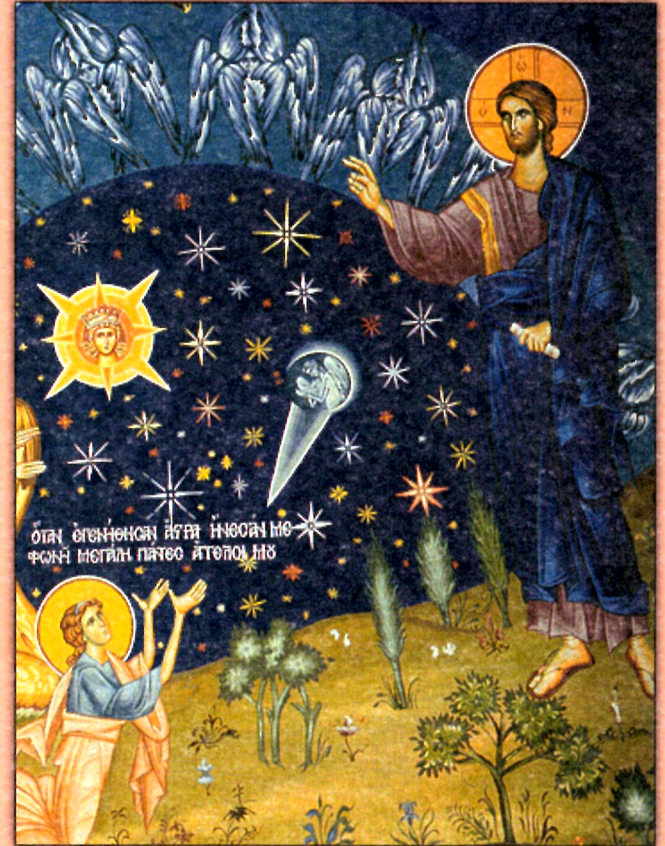
Icon of Creation