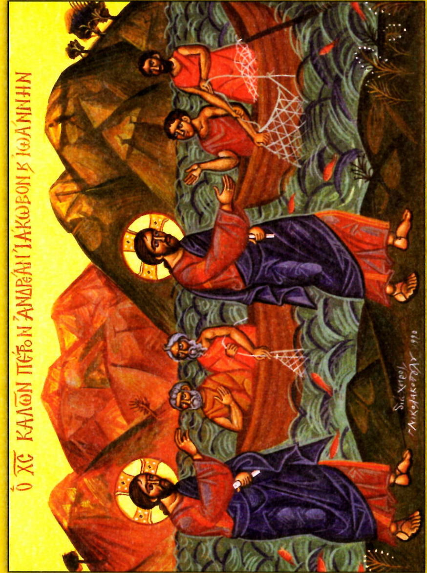
Icon of the Call of the Apostles