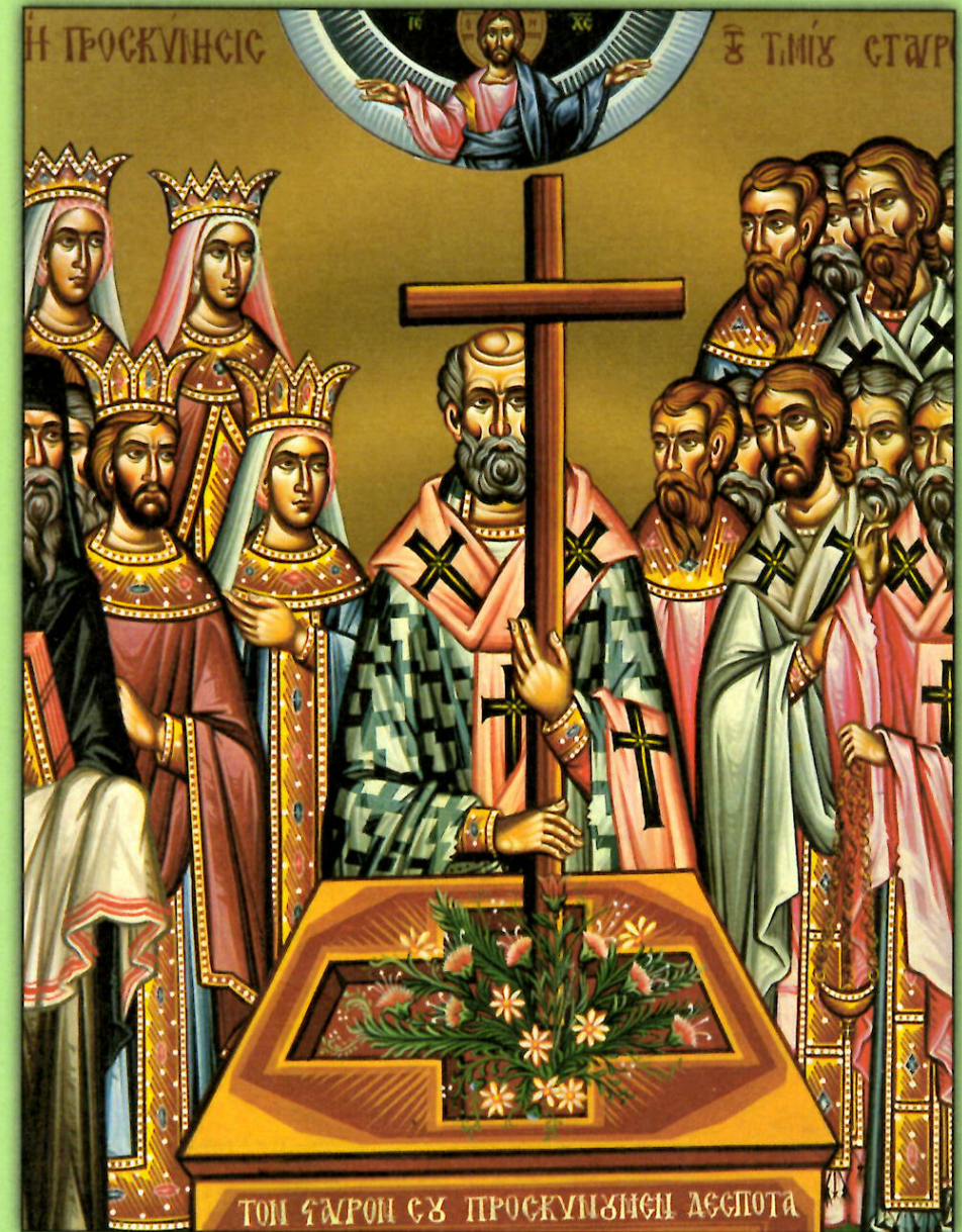
Icon of the Sunday of the Holy Cross