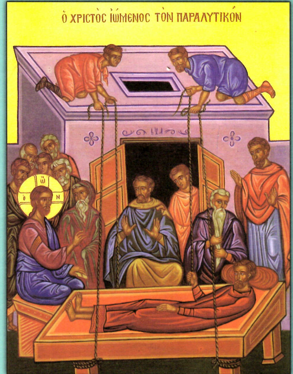
Icon of Healing the Paralytic