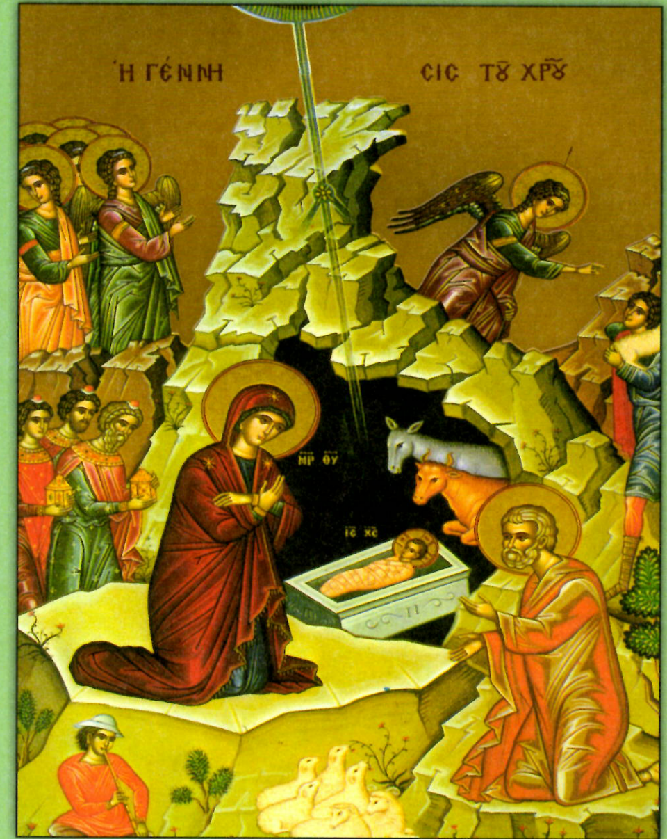
Icon of the Nativity of Our Lord