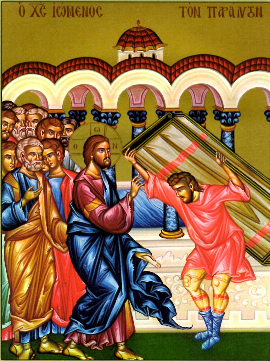
Icon of Christ Healing the Paralytic