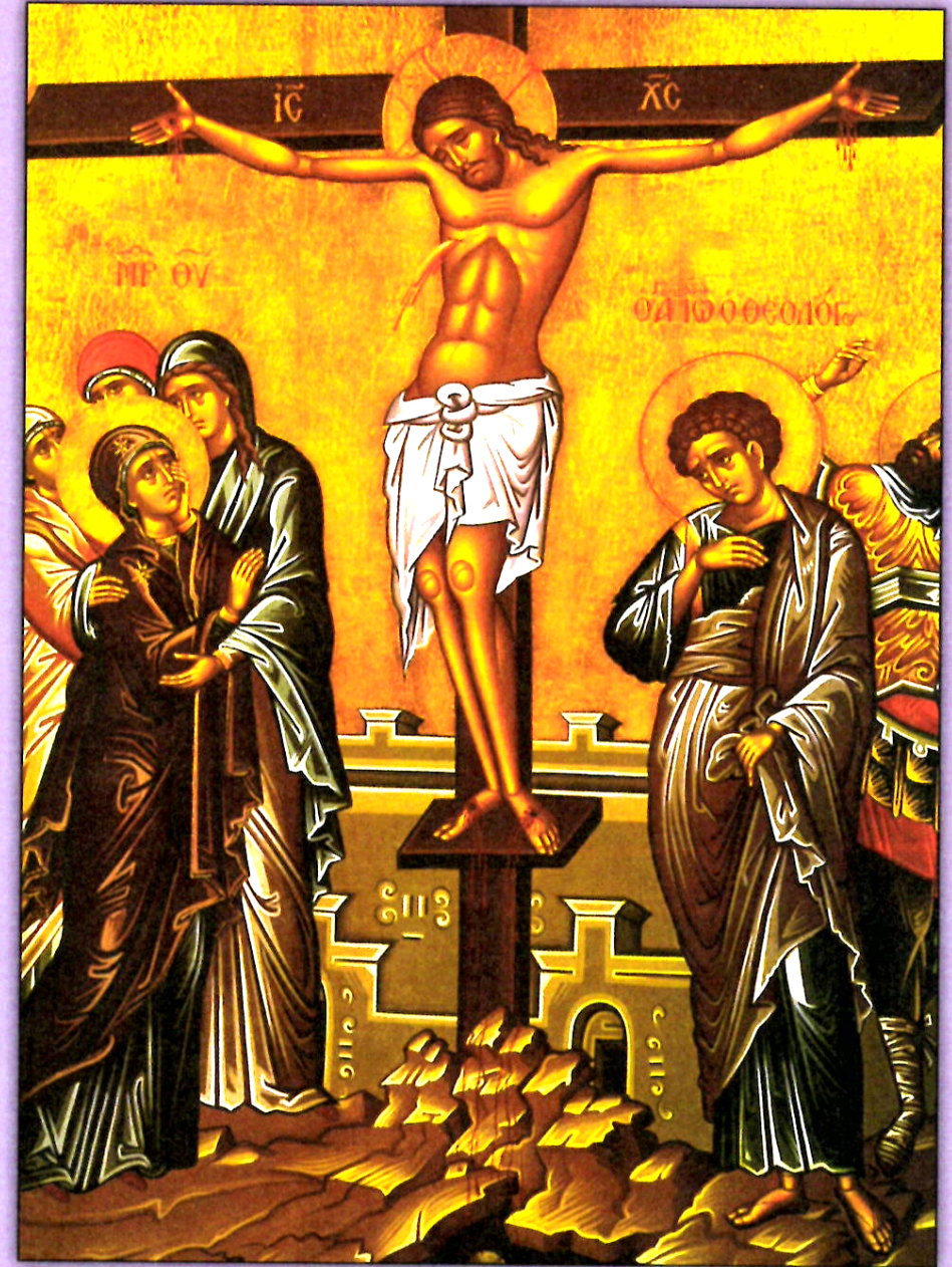
Icon of the Exaltation of the Holy Cross