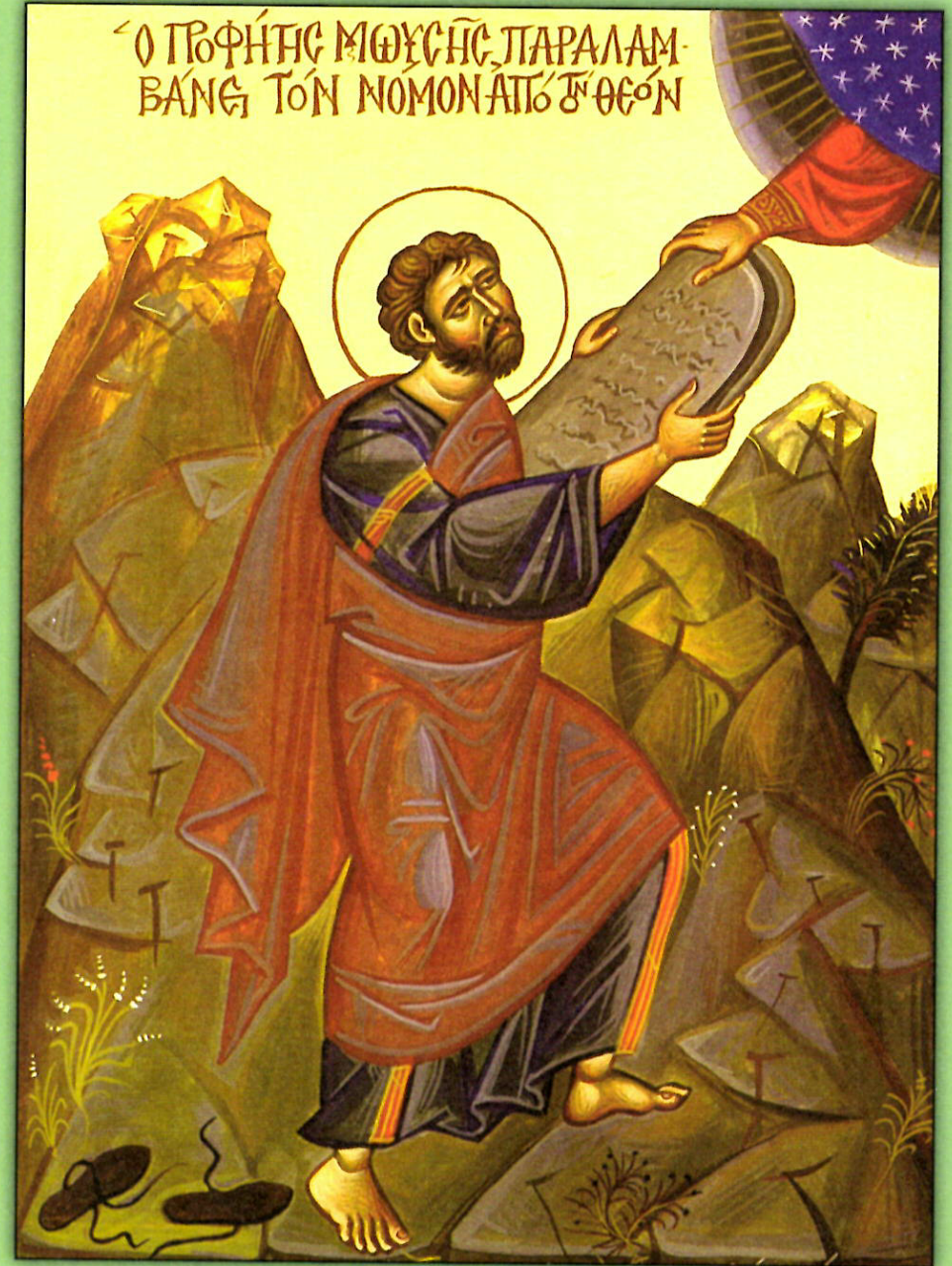
Icon of Moses and the Ten Commandments