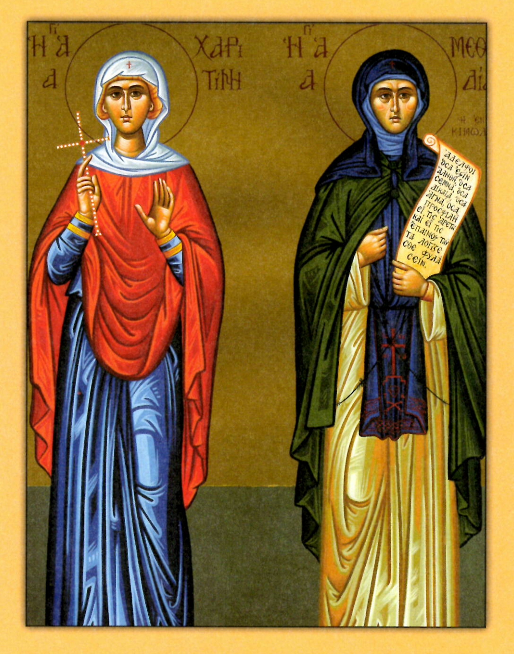
Icon of Saints Charitina and Methodia -- October 5th