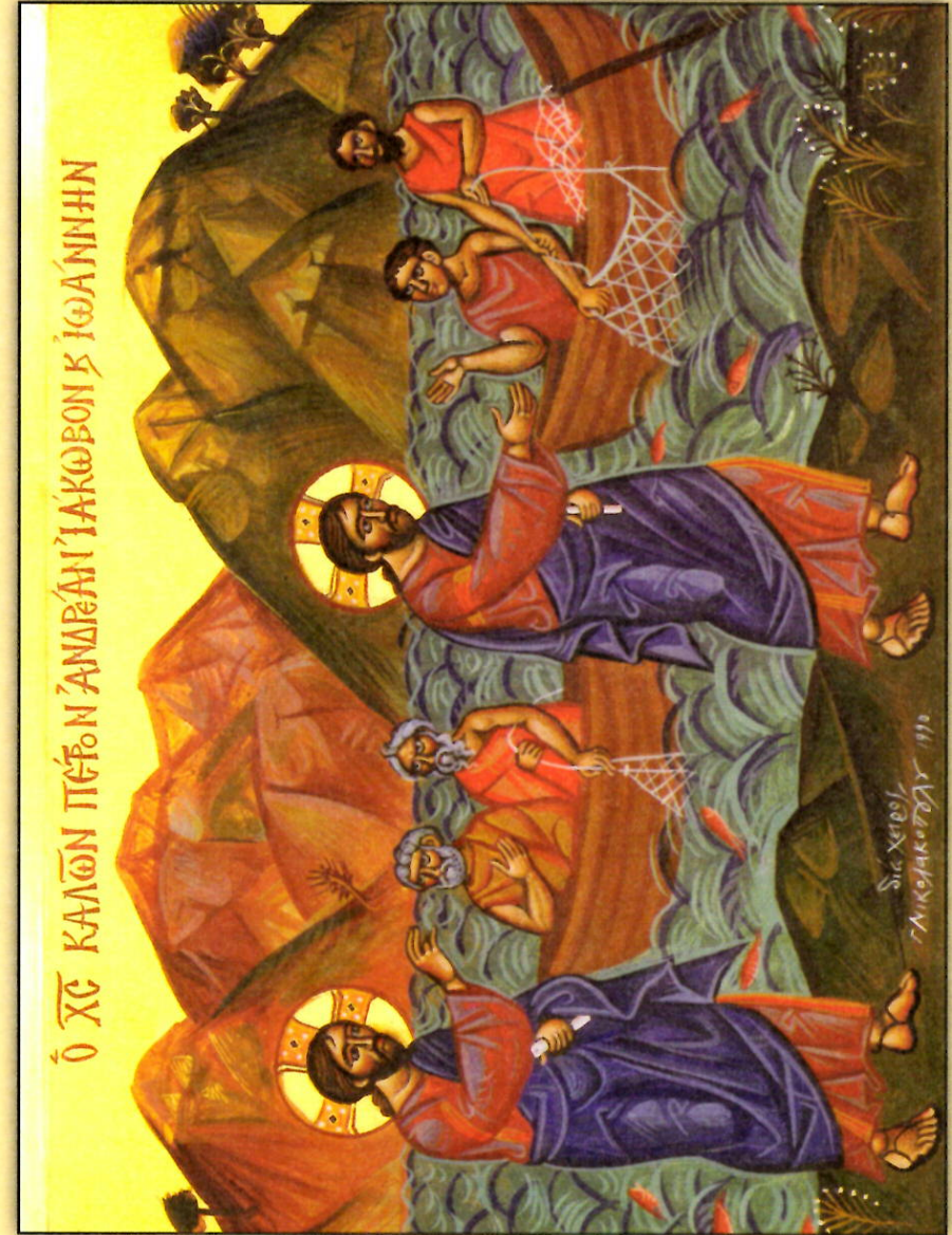
Icon of the Call of the Apostles