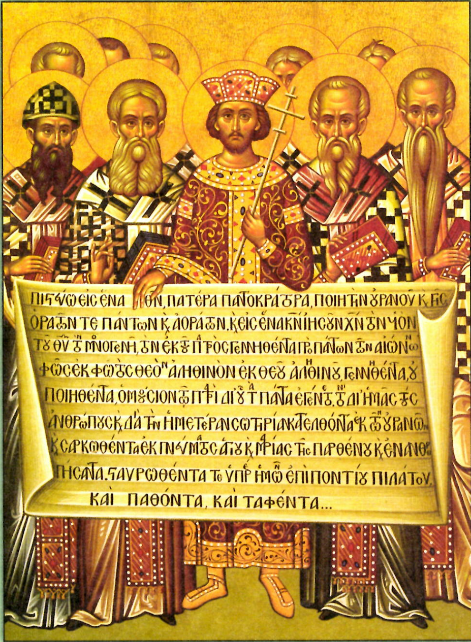
Icon of the Fathers of the First Ecumenical Council of Nicea