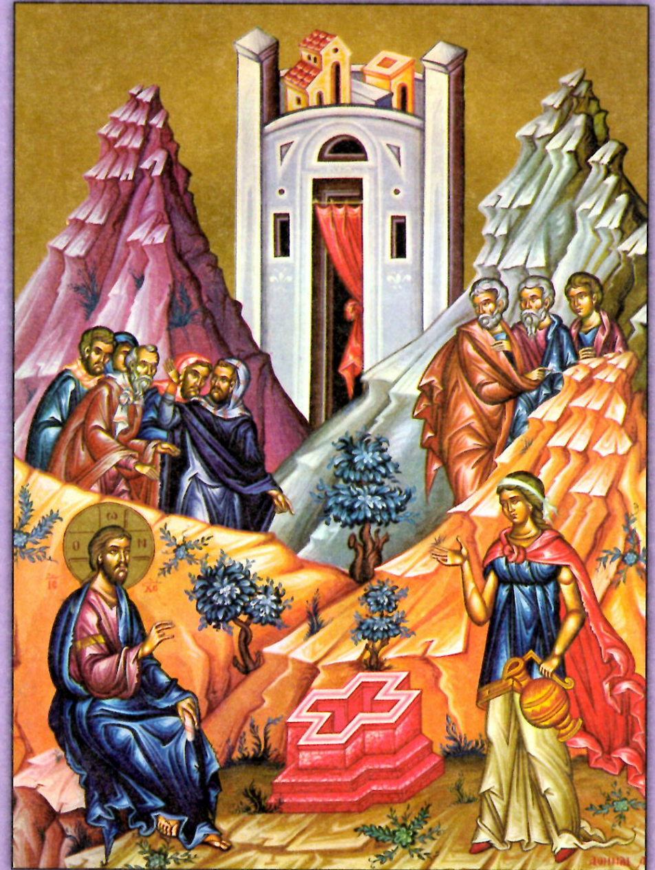
Icon of Christ with the Samaritan Woman