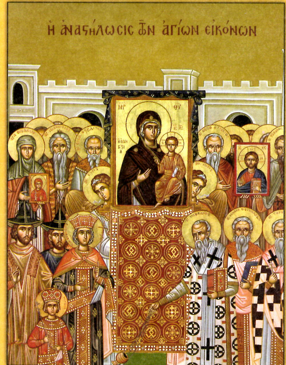
Icon of the Holy Images