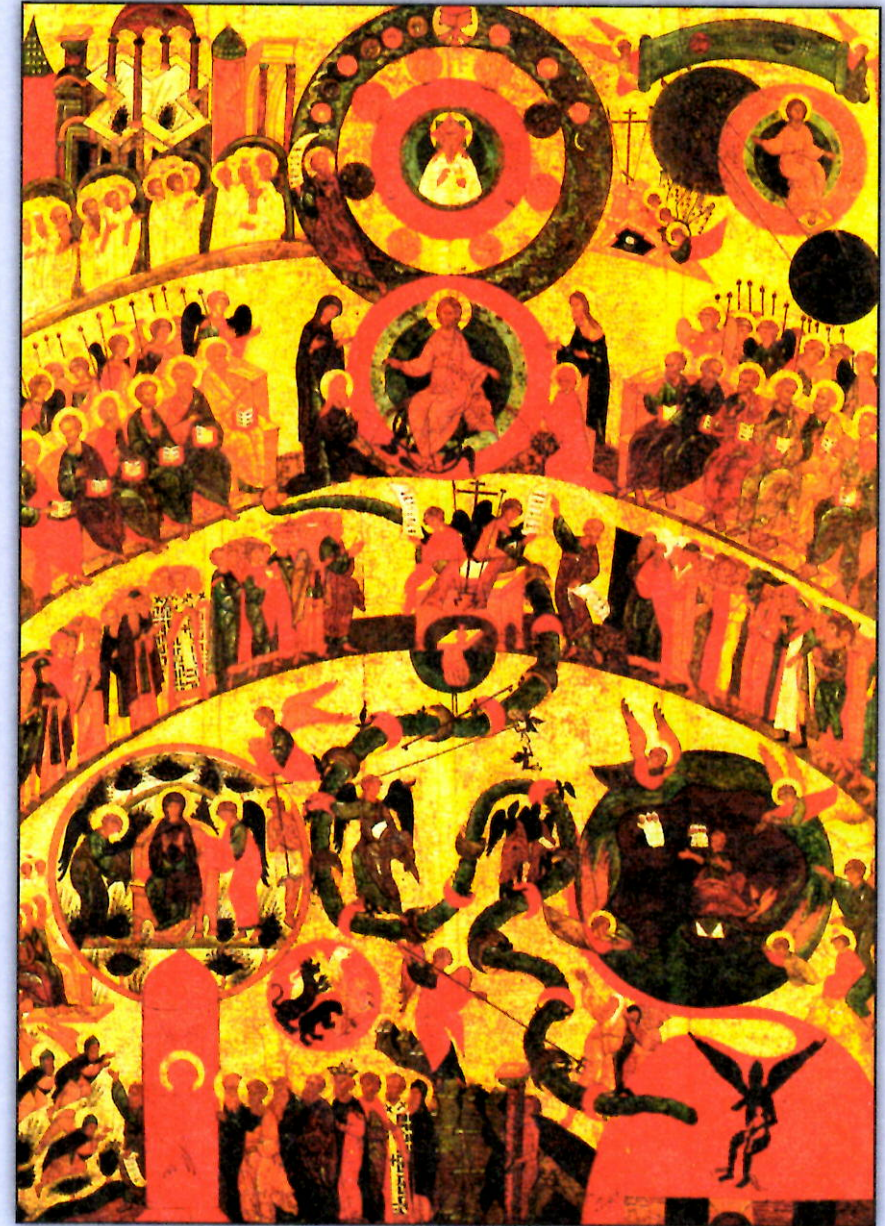
Icon of the Last Judgment