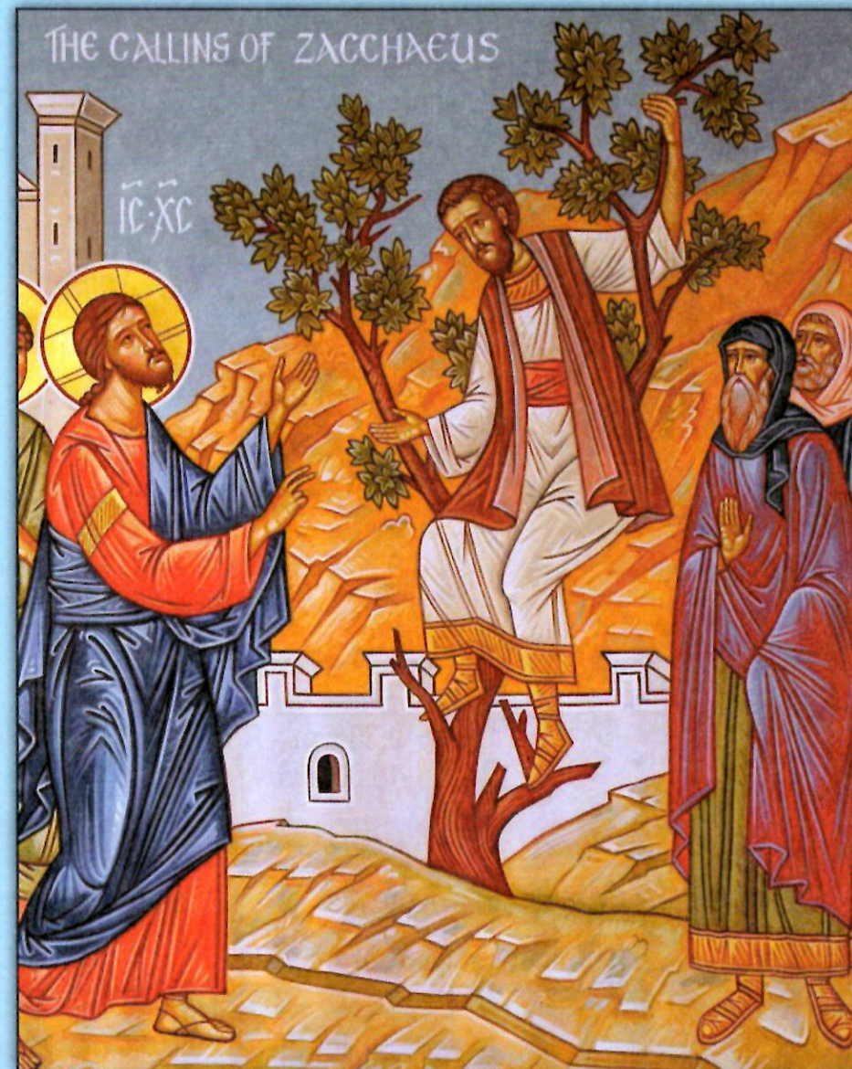
Icon of Zacchaeus in the Sycamore Tree