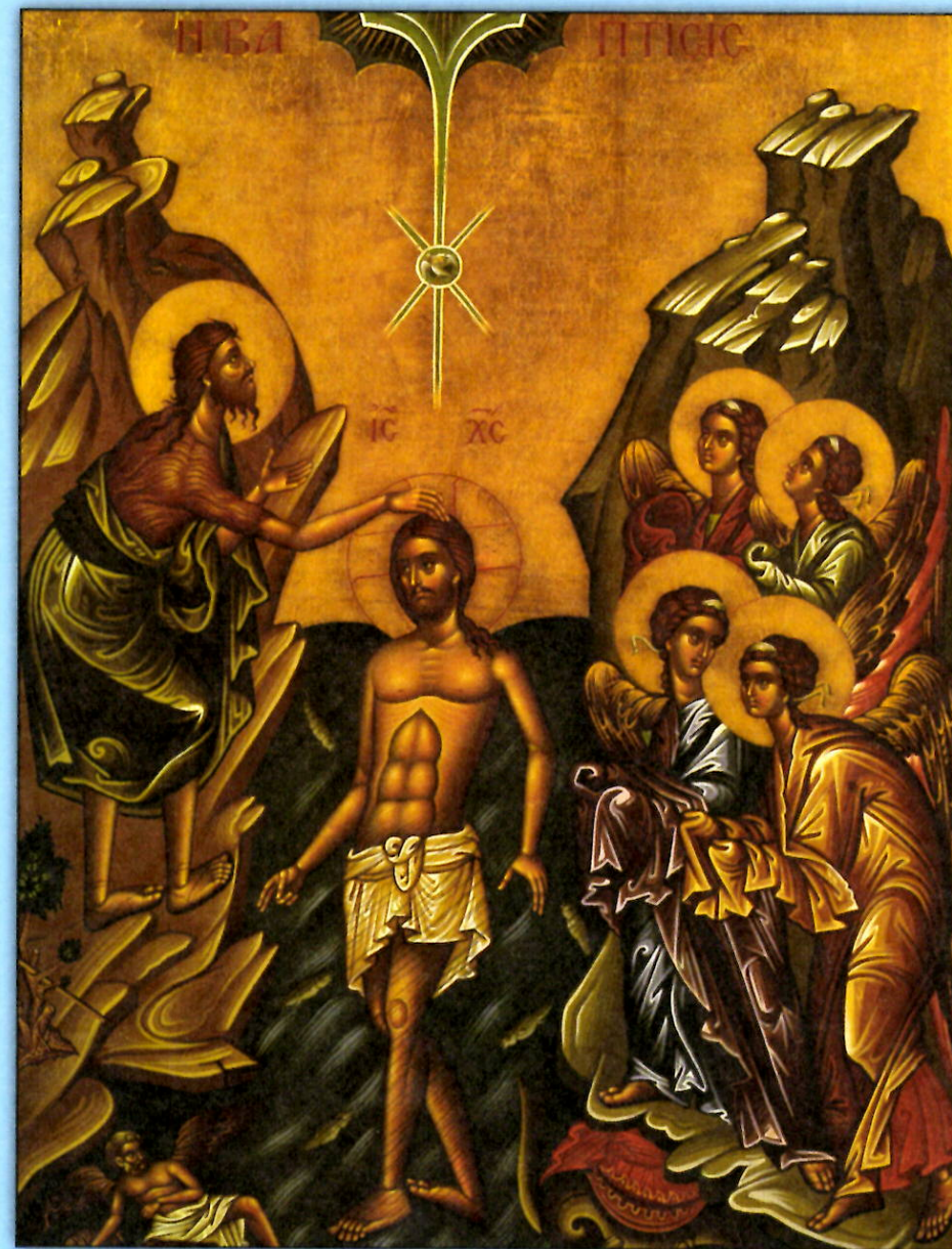
Icon of the Theophany of Our Lord -- January 6th