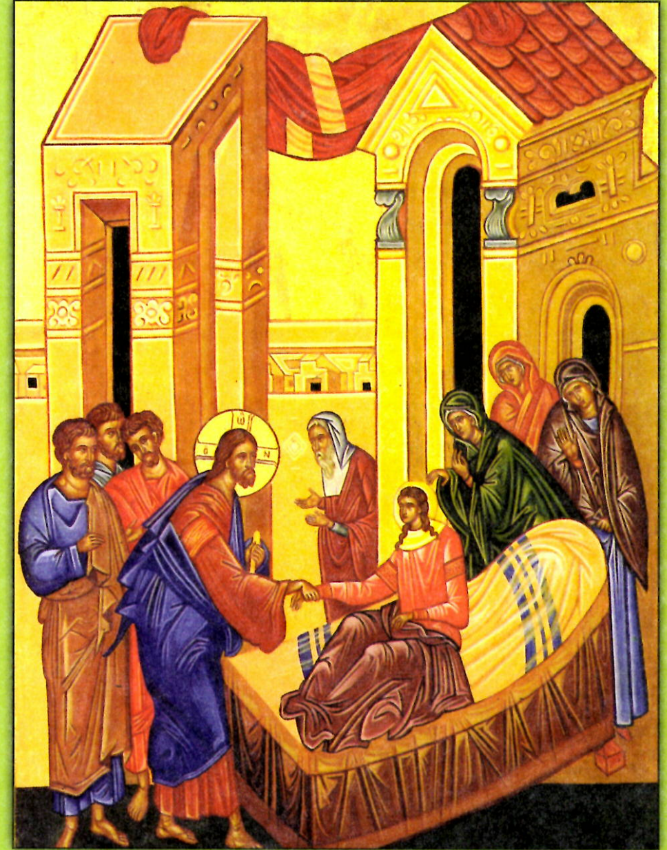
Icon of Healing Jairus' Daughter (Luke 8:41-56)