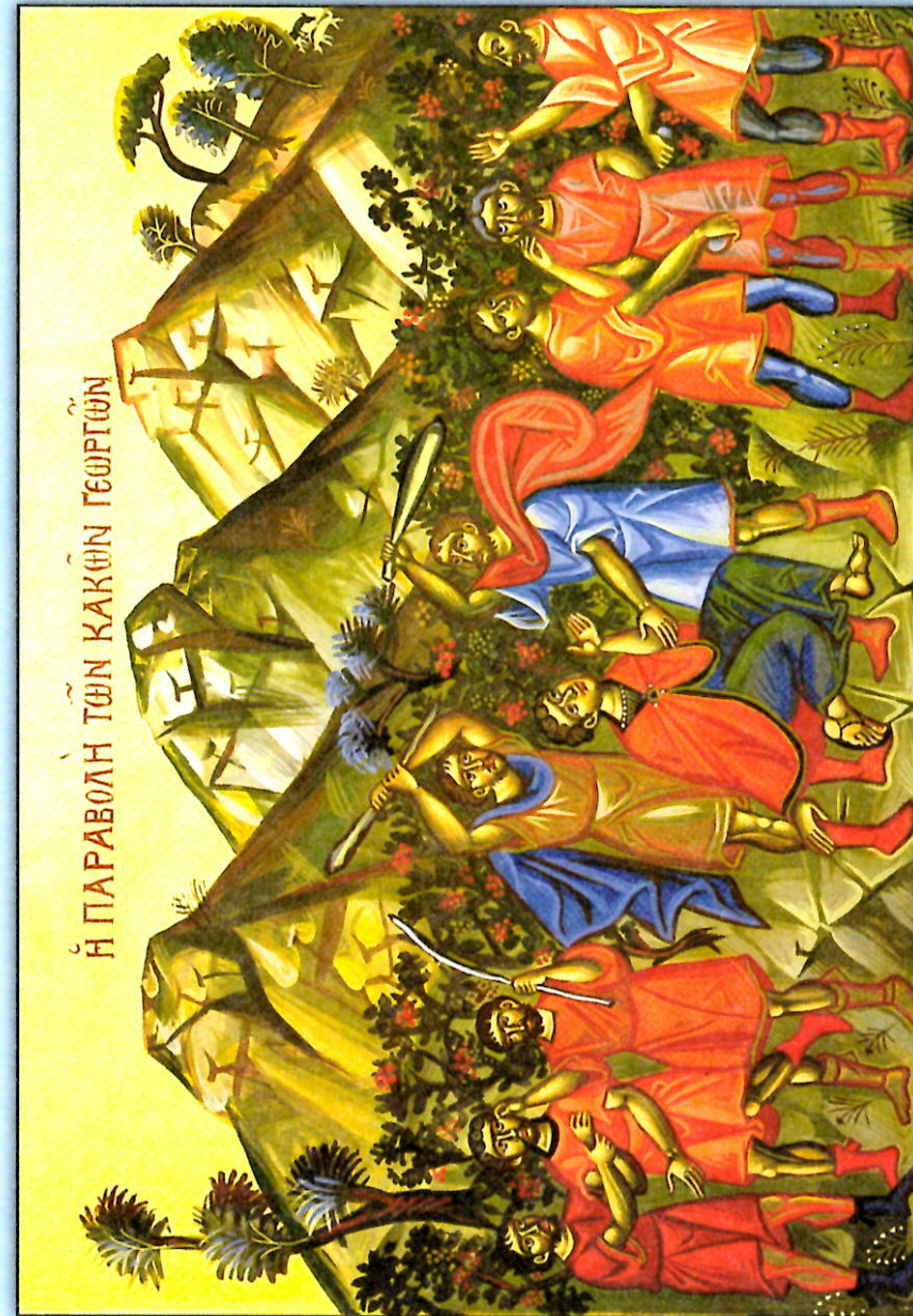
Icon of the Wicked Tenant Farmers (Matthew 21:33-42)