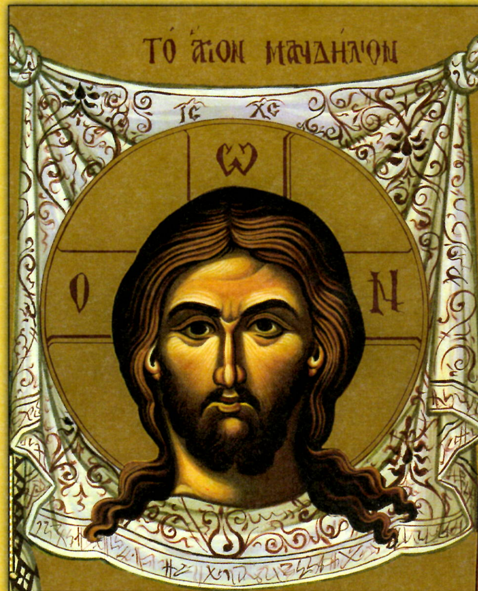
Icon of the Holy Napkin -- August 16th