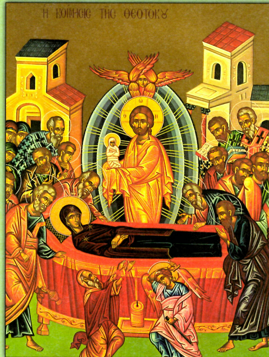
Icon of the Dormition -- August 15th