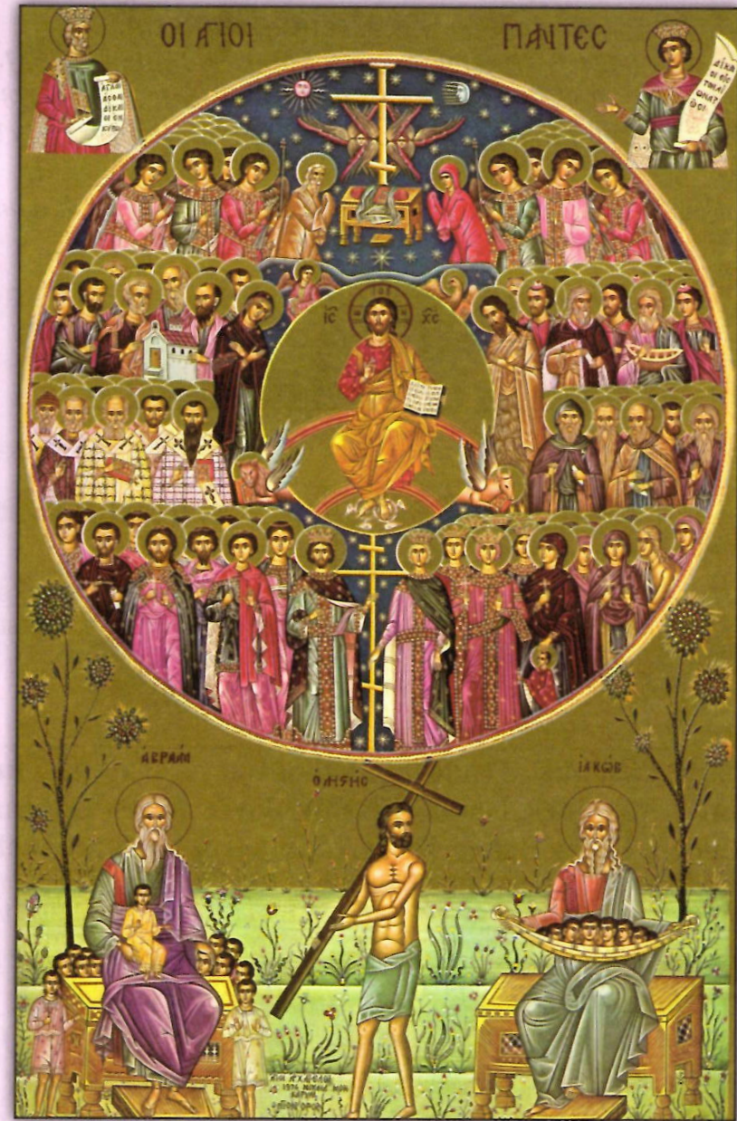
Icon of All Saints